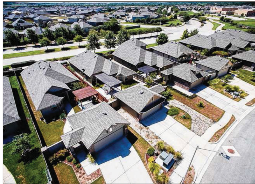
Bastrop is weighing changes to its subdivision ordinance that could include stricter design standards and a more streamlined process for developers. There will be three public meetings on Wednesday and Thursday.