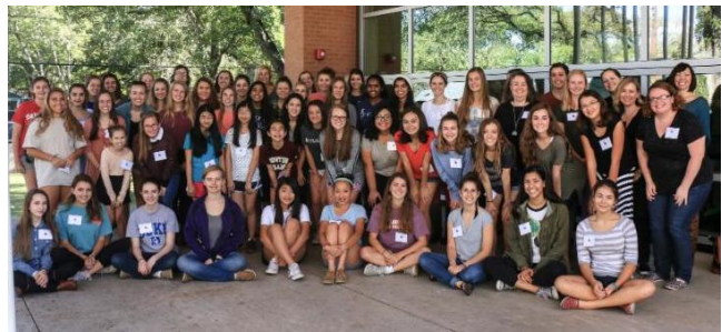
2015-2016 g3 members and advisors

Impact Austin's youth initiative, Girls Giving Grants (g3), has its largest class to date with 70 girls participating in the grant making process. Demand was so high for participation that applications were closed early! Members are currently busy reviewing 37 grant applications from local youth-serving nonprofits, meeting at the The Girls' School of Austin that has graciously provided space for their activities. Grant finalists will be selected in February.