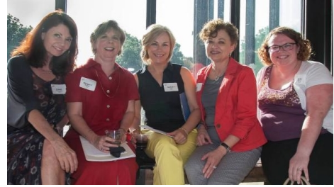
Members enjoy meeting and catching up.

Our organization continues the momentum toward an amazing 2016. Our next membership event will be Wednesday, December 2nd from 6:00-7:30 PM at the Austin Custom Winery on Brodie Lane . Grab a friend and mix and mingle with other Impact Austin members and prospective members.