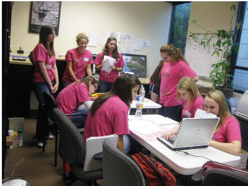
G3 ARC members preparing for their semi-finalist presentation

On Sunday, Sept 19th from 2:00-3:00 p.m. , G3 will hold a membership recruiting event at Velocity Electronics, 2208 Energy Drive, Austin, TX 78758. Membership is open to girls in grades 8 through 12 in the Austin area who are willing to make the required $100 donation and a commitment of time and energy from October 2010 through April 2011. G3 members are eligible to receive up to 30 hours community service credit through their participation in Girls Giving Grants.