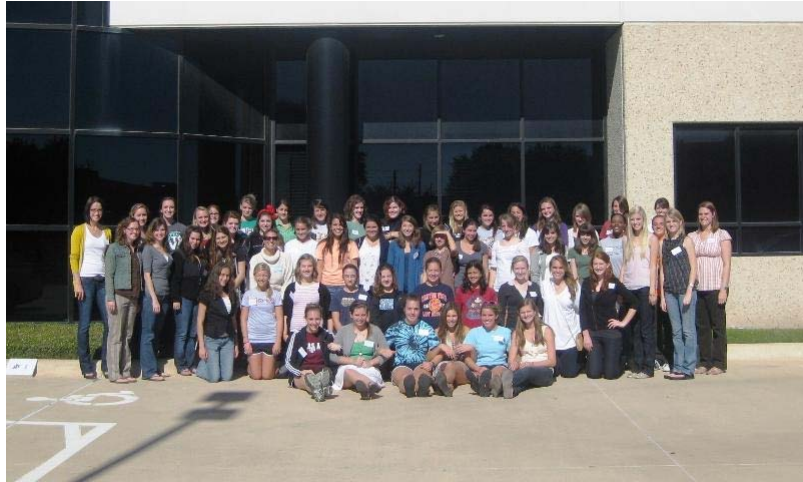
2009 - 2010 G3 Members

On Sunday, Sept 19th from 2:00-3:00 p.m. , G3 will hold a membership recruiting event at Velocity Electronics, 2208 Energy Drive, Austin, TX 78758. Membership is open to girls in grades 8 through 12 in the Austin area who are willing to make the required $100 donation and a commitment of time and energy from October 2010 through April 2011. G3 members are eligible to receive up to 30 hours community service credit through their participation in Girls Giving Grants.