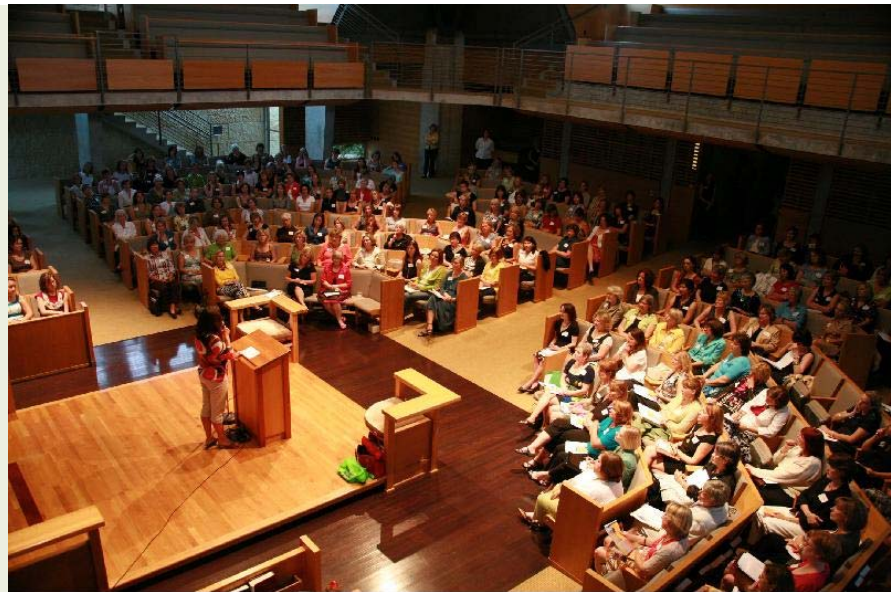
Wonderful member turnout at the 2009 Annual Meeting

Our vision is that our women are inspirational role models reaching their full giving potential for a better quality of life in our community. We will ensure our long-term sustainability by tapping into the talents of our members and building Impact Austin from the "inside out."